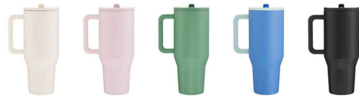
cream #75304 pink sand #75358 sage #75319 riptide #75360 black #75384

40 oz double wall 18/8 stainless steel thermal mug with copper vacuum insulation, threaded lid, matching flip-up spout, soft straw, wide handle, removable silicone base, and powder coated finish