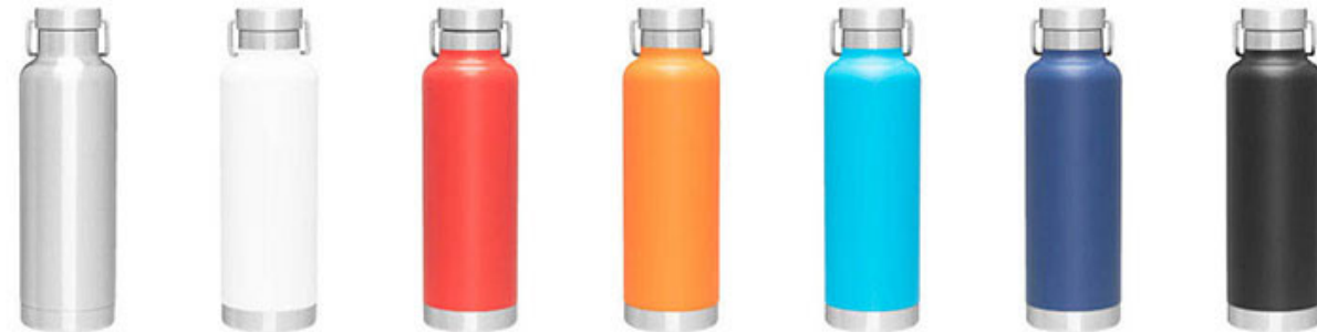
stainless #989061 white #989571 red #989573 orange #989575 aqua #989570 navy #989572 black #989544

24 oz double wall 18/8 stainless steel thermal bottle with copper vacuum insulation, threaded stainless steel insulated lid, swing handle, high polish stainless steel rim, stainless steel base, and powder coated finish