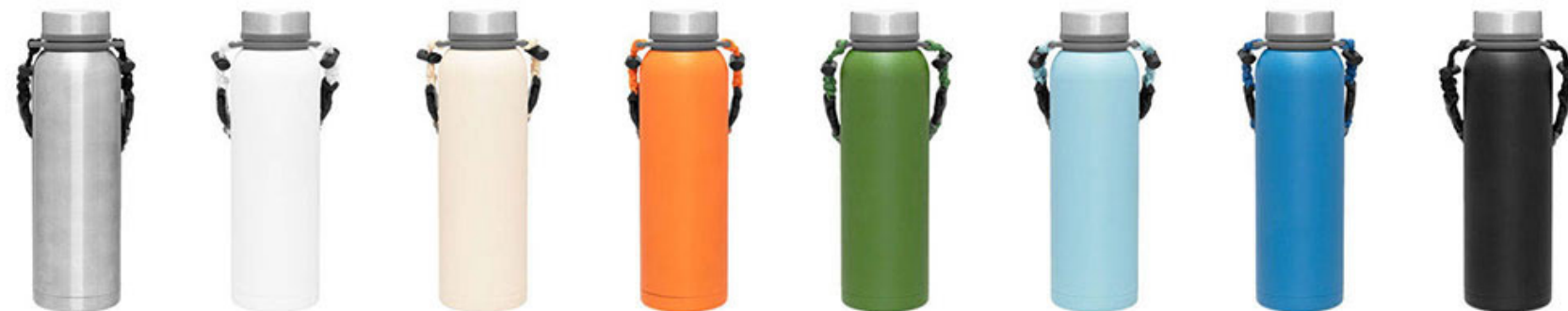
stainless #966561 white #966571 dune #966504 tawny #966589 moss #966501 cloud #966560 steel blue #966582 black #966544

32 oz double wall 18/8 stainless steel thermal bottle with copper vacuum insulation, threaded stainless steel insulated lid, silicone ring, removable strap with buckles, removable clasps, and powder coated finish