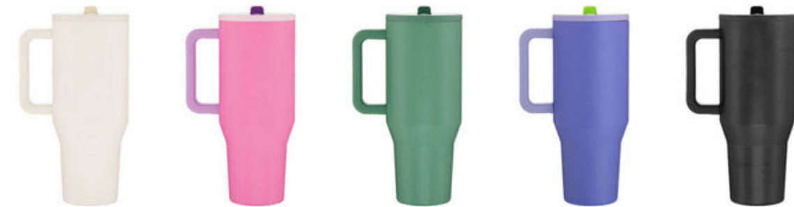
cream #72504 pink sugar #72558 sage #72519 lime rickey #72578 black #72584

32 oz double wall 18/8 stainless steel thermal mug with copper vacuum insulation, threaded lid, matching flip-up spout, soft straw, wide handle, removable silicone base, and powder coated finish