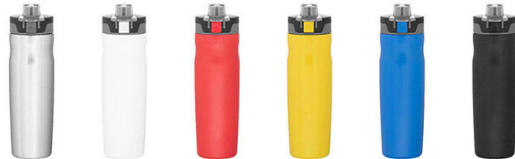
stainless #925061 white #925371 red #925383 triumph #925359 victory #925382 black #925344

20.9 oz double wall 18/8 stainless steel thermal bottle with copper vacuum insulation, threaded lid, push-button locking mechanism, drinking spout, spout cover, removable carrying strap, and powder coated finish